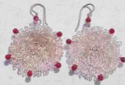
Anemone Pendant Earrings

AAC-AOS-AN- PER-S4 4cm Silver and red corals