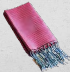
Scarf Phal-Vijaya AAC-KSPA-R2BLUEV PC41 50 x 180cm 100% Silk