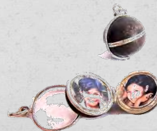
Ball-Shaped Photo Pendant

AAC-AOS-AN- PER-S4 4cm Silver and red corals