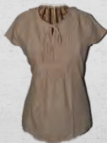
WT-001 AAC-GC-WT-001 Cotton