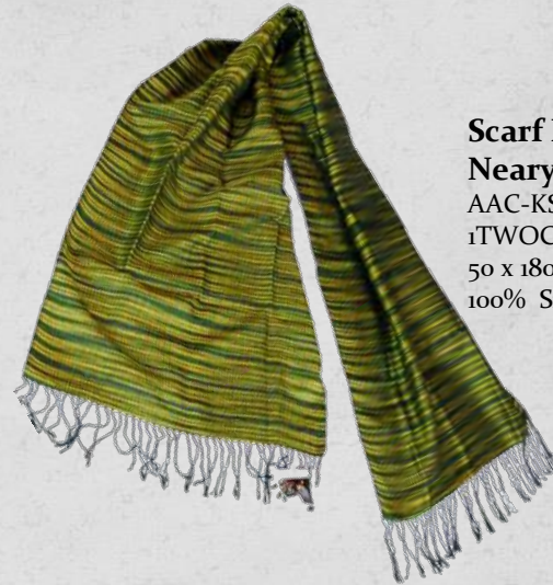
Scarf Phal-Nearyroath AAC-KSPA-RWP-1TWO PC73 50 x 180cm 100% Silk

Khmer Silk Processing Association (KSPA) is a non-profit business created in 1995. Our mission is to preserve the heritage of Cambodian traditional high value silks; to provide sustainable income to widows, disables, and weaver communities through employment and productions; and to preserve eco-friendly productions. Totality of the incomes are reinvested in the organization to support the salaries, cost of the association, and to fund the social development programs for orphans, poor and vulnerable children through capacities building and healthcare within the Future Light Orphanage of World Mate. www.phalycraft.com