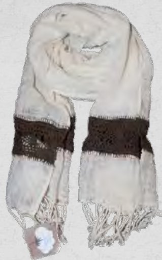
Scarf NSC Original AAC-NSC-T2F1 54 x 185cm 100% Organic cotton