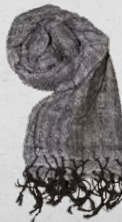
Scarf Rasmey AAC-NSC-T3F1S 37 x 185 cm 100% Organic Cotton