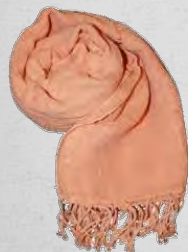
Scarf Rasmey AAC-NSC-T2F1L 90 x 190 cm 100% Organic Cotton