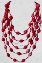
Thary Silk Necklace AAC-AF120 10 x 40 Silk