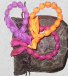
Viviya Bracelet AAC-AF110 Organza silk