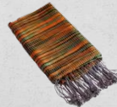
Scarf Phal-Ratanak AAC-KSPA-PL07V3SILVERP C 50 x 180cm 100% Silk