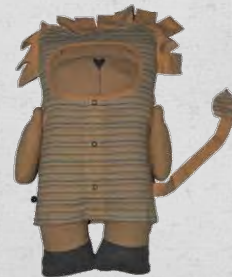
Doll-001 AAC-GC-Doll-001 Cotton