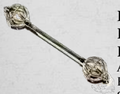
Baby Rattle Decorated