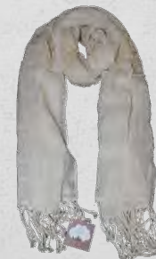
Scarf NSC Original AAC-NSC-T2F1 54 x 185cm 100% Organic Cotton