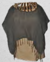
WT-12-06 AAC-GC-WT-12-06 Cotton