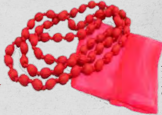
Ananda Necklace AAC-AF130 Organza silk