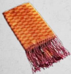
Scarf Phal-Mongkul AAC-KSPA-RWP-SILVER PC51 50 x 180cm 100% Silk